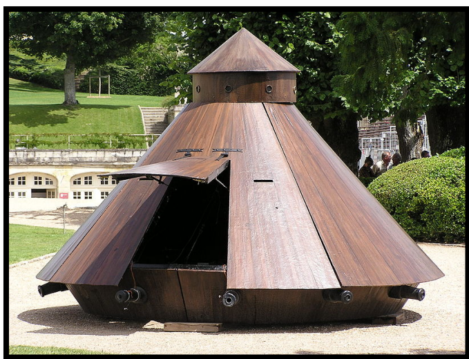
Da Vinci's armored and wheeled battle tank

Retired Army personnel must now wear the new “Soldier for Life” patch on the left shoulder sleeve of the service uniform, in place of their last unit of assignment patch.